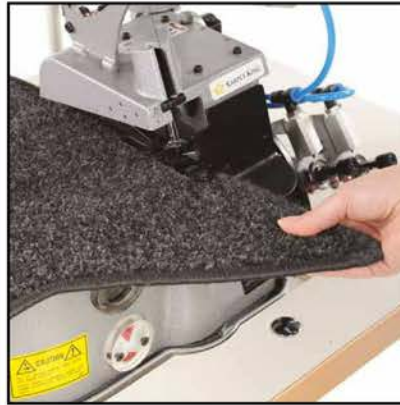
2. Edging to car mats