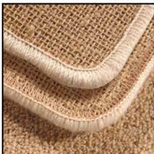
1. Stitching completely covers the top and bottom edges of the carpet, or can be set to just cover the visible top area.