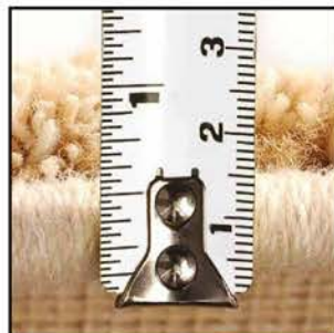
3. Sewing thickness can range from 5mm to a maximum of 12mm.

From thick carpets to thin (image 3), the KK103 can easily cope, however on some of the extremely thick carpets we recommend that the edges should be bevelled prior to sewing in order to create a neater slimmer edge profile that will also reduce the tripping hazard.