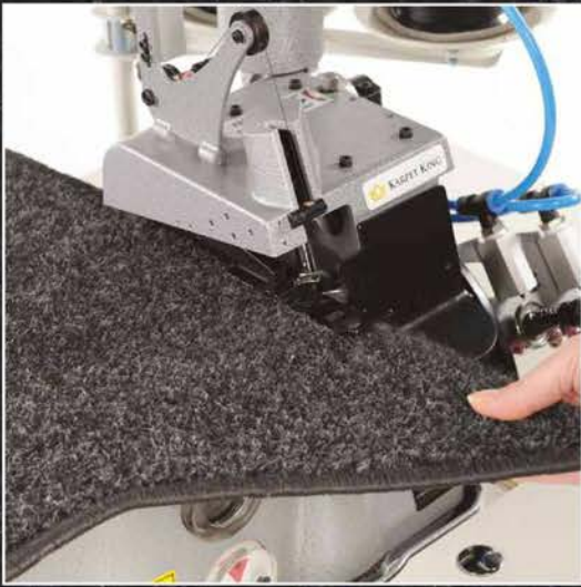
1. External edge whipping.