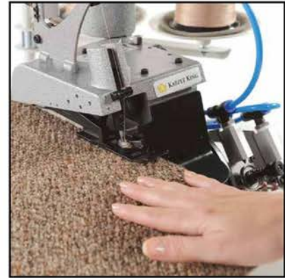
3. Turns carpet off-cuts into mats etc.