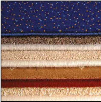
1. Carpeting of all types and various thicknesses can be edged to suit all needs.